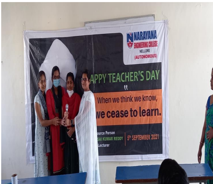
A skit presented by the students.